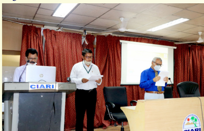
Vigilance awareness week celebration

Vigilance awareness week was celebrated in ICAR CIARI 26th October, 2021 to 1st November, 2021 on the theme “Independent India @75: Self Reliance with Integrity in which Essay Writing Competition, Awareness Programme on Ill-effects of Corruption, Painting Competition, Seminar on Policies / Procedures of the organization and preventive vigilance measures and Awareness Rally on Vigilance was conducted, A total 150 (staff and students) were participated.