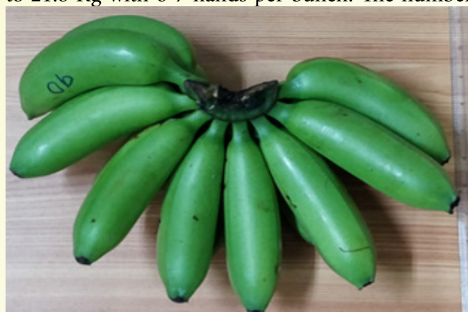
High yielding banana accession

A local banana accession was collected and evaluated at experimental farm for past three years and it was found to be high yielding than the other local and commercial varieties grown in the Island. This is suitable as a table variety due to its taste similar to red banana. The biochemical analysis of the ripe fruits showed high TSS and also rich in flavonoids. The bunch weight varied from 19.2 Kg to 21.8 Kg with 6-7 hands per bunch. The number