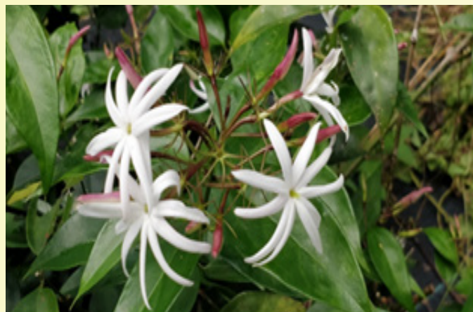
Leaf petiole propagation in star jasmine

Star jasmine or shiny jasmine ( Jasminum nitidum ) is an introduced species in the Island and is a potential loose flower which blooms round the year in Island condition. The flowers are very at cuttings showed maximum success (92-95%). However, an alternate propagation method through leaf petioles was also standardized in media composition of coir:pith: soil: FYM in 1:2:1 ratio in protrays.