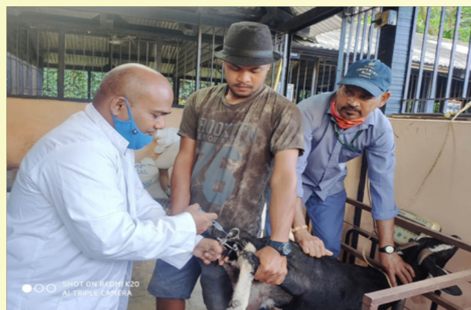
Artificial insemination in goat

Semen collection in goat has been standardized and artificial insemination was successfully done. Inseminated animals did not express oestrus symptoms since 2 months indicated that these animals became pregnant. Thus the semen collection by artificial vagina method, preservation in liquid state with Tris based semen extender, inseminated through trans-cervical method in Andaman local goat and Teressa goat was initiated in ICAR-CIARI, Port Blair, Andaman and Nicobar Islands.