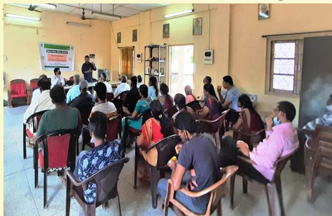
Farmers attending the awareness programme

Wimberlygunj under the Mera Gaon Mera Gourav programme on 20th November, 2021. A number of improved technologies related to horticulture and animal husbandry have been developed at ICAR-CIARI for the benefit of islands farmers and to disseminate those, creation of awareness is a key step. A total of 23 farmers/ farm women and entrepreneurs