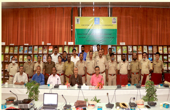
Trainees from Department of environment and Forest

ICAR - CIARI has conducted one day training programme for the executive staff of Department