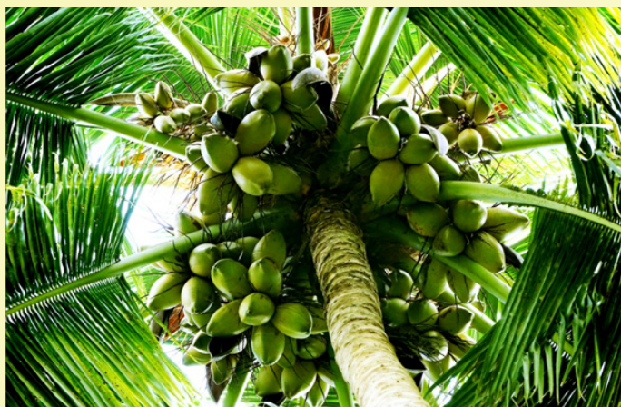
A high yielding palm from among the selected Andaman Ordinary Tall

The conserved population of Andaman Ordinary Tall was subjected to population analysis for morphological traits including yield of fruits. The population showed significant variation for leaf morphology, inflorescence traits and fruit production. Based on the performance of desirable and typical traits (stout and strong stem, circular crown, number of leaves and bunches on the crown, setting, estimated yield of fruits per palm per year, fruit shape, fruit colour, fruit weight and kernel weight), a group of 33 age number of 35 to 42 leaves on the crown, 18 to 21 bunches on crown with fruits/ buttons, 9 to 18 nuts per bunch, oblong fruits, mixture of green and brown fruits, kernel weight over 400g per fruit. The average estimated annual fruit yield of the selection ranged from 110 to 152 with a mean of 126 fruits under rain fed conditions of Andaman. The average estimated copra out turn of the selection was recorded as 27.6kg per palm year with copra content of 219g per fruit.