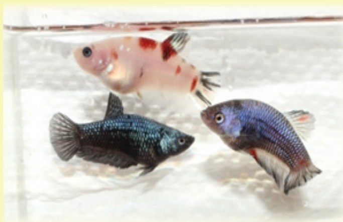
Siamese fighting fish ( Betta splendens )

full red, golden, platinum and other assorted colours. Bettas are the most commonly traded fish in the aquarium trade worldwide with their marketable size range of 2 to 3 inches. The price of the fish varies as per the quality and the strain with range from INR 150 to 25000. Approximately 1000 Nos. of fighting fish fries were produced in the ornamental unit.