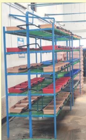
Recirculatory structure for mud crab fattening model

A vertical re-circulatory mud crab fattening unit was set up and stocked with 60 number of mud crab ( Scylla serrata ) and 40 number of ( Scylla olivacea ). The water crabs measured from 9.0 cm to 3.0 cm (carapace length) and weighing (0.16 kg to 0.51 kg) and feed with trash fishes three times a day.