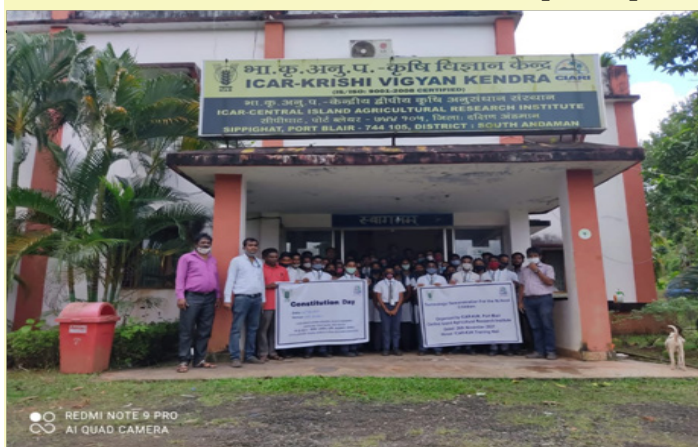
Observance of Constitution day

ICAR-KVK-CIARI celebrates Constitution day to commemorate the adoption of constitution on 26th November, 2021 in Krishi Vigyan Kendra, South Andaman. In the event many scientists were spoke on the genesis of Constitution day, importance of Constitution in shaping the overall development of the country and also spoke on the role of CIARI/ KVK in Agricultural technology development in the island. A total 35 students were participated