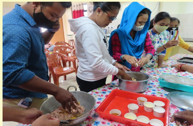
Training programme on “Value Added Poultry Products”