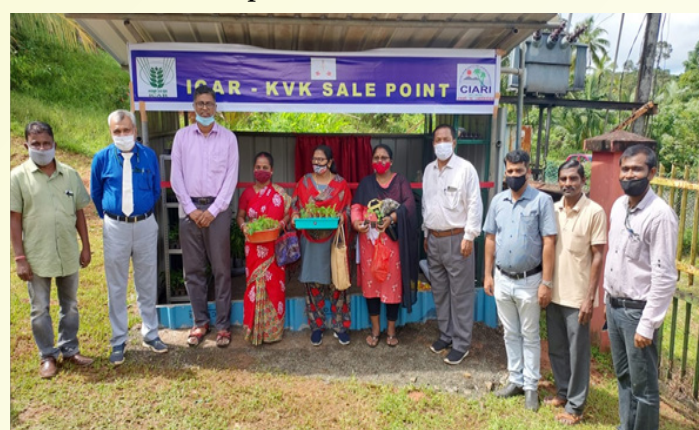
Inauguration of Farm produce Sale Point

Farm produce Sale Point of KVK, Sippighat inaugurated by Director, CIARI at Sippighat, South Andaman, Port Blair with an objective to provide quality planting material of different horticultural crops on 17th November, 2021.