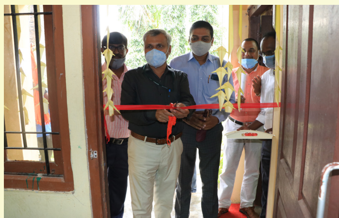
Inauguration of Dweep sale point

With an objective to provide Quality Planting material of different horticulture crops like fruits, vegetables, tubers, flowers, spices, plantation, medicinal plants along with agriculture, fisheries, animal husbandry component and their farm products, ICAR-CIARI has