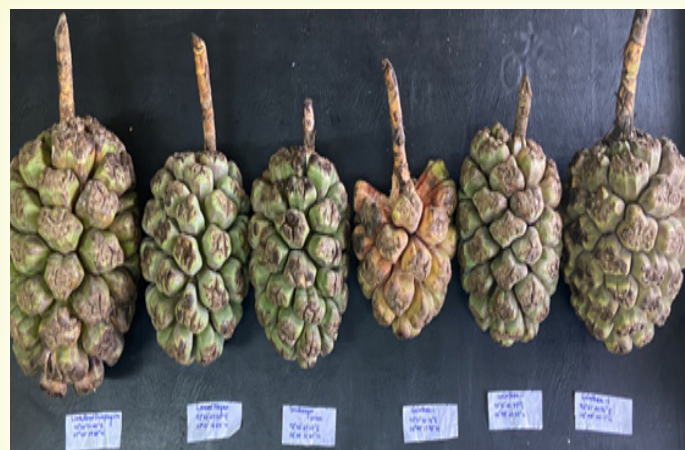
P. Pandanus lerrum fruit variability (Collection from Great Nicobar)

Twenty two Pandanus lerrum accessions were collected from Car Nicobar and Great Nicobar Islands and the morphological observations were recorded. The fruit weight ranged from 7 kg to 22 kg, and the fruit lobes ranged from 40 to 84. A total of 13 each of Pandanus tectorius and Pandanus odorifer accessions were collected from Great Nicobar Islands.