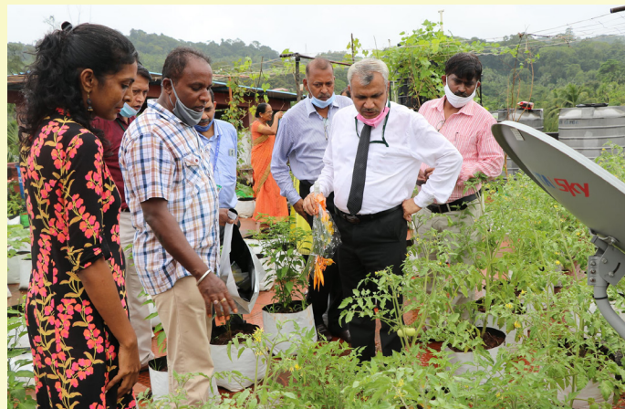
Demonstration of rooftop garden

ICAR-CIARI in collaboration with NABARD, Port Blair, has implemented the project on "Horticulture based sustainable roof top production model for nutritional and livelihood security of urban households of Andaman Islands" in three public sector units and six households at different places of South Andaman. Various horticulture crops like vegetables, spices, flowers and medicinal plants are grown by the beneficiaries in grow bags using organic media.