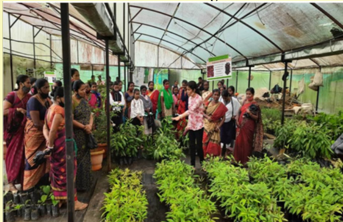
Trainees at Horticulture Plant Propagation unit

Eighty members of the women self-help groups from Tushnabad and Ferrargunj visited ICAR-CIARI through Surabhi, NGO on 25th November, 2021. In order to promote cultivation of island suitable spices and underutilized fruits among the farm women,