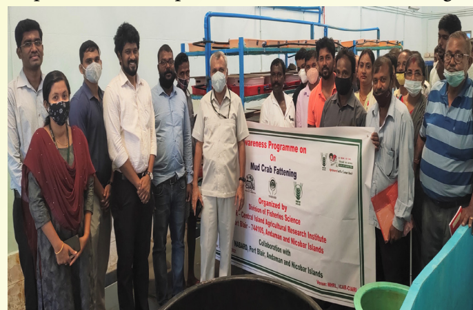
Training on mud crab fattening