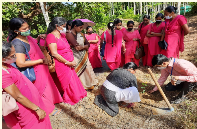
Learning by doing in the experimental field by trainees

An awareness programme on “Scientific Management of Kitchen Gardens for Health and Nutrition” was conducted at ICAR-Central Island Agricultural Research Institute, Port Blair on 10th December, 2021. Anganwadis play a vital role in the development of younger generations. Establishment and maintenance of kitchen gardens is one of the prime activities in this regard. A programme was conducted with the objective to impart knowledge to the participants on various aspects of kitchen gardening with special emphasis on immunity boosting plants. The programme had 21 participants from 19 Anganwadi centres of South Andaman, including 2 Mukhya Sevikas.