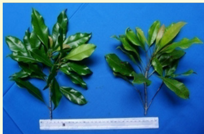
Leaf traits of CIARI Clove-1 plus tree

A group of plus trees were selected based on desirable traits viz., early flowering, regular bearing, bold buds and higher clove yield from Sippighat farm of the institute. Characterization of the selected group of plus trees have revealed broader and darker green leaves, medium canopy volume, higher number of branches, higher number of leaves, more flowers, regular flowering when compared to the general population. The average yield (2007 planted and selected as plus tree) ranged from 1.8kg to 3.85kg dry buds per tree per year (average 2.5kg) when compared to unselected trees under rain fed conditions of South Andaman. The plus trees were selected from a seedling population planted during 2007 (150 trees) which was obtained from three selected trees planted