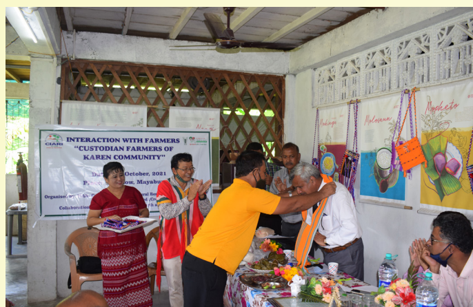
Interaction with Karen community at Middle Andaman