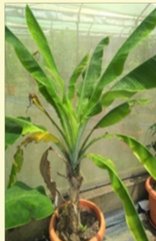
M. sabuana (syn. M. indandamanensis )

and fertile seeds. A plant was observed to have morphological symptoms resembling that of Banana Bunchy Top Virus (BBTV). This was further confirmed using BBTV Specific primers thereby indicating susceptibility of the species to the virus.