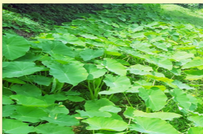
Megha Taro (TTr-12-8) performance at Port Blair

Based on the varietal evaluation from 2012-19 under AICRP on tuber crops, the entry TTr 12-8 (Mega Taro-2) has been recommended for release in Bihar, Jharkhand and A&N Islands during the 19th Annual Group Meeting of AICRP (TC) held at ICAR- CTCRI, Thiruvananthapuram. Accordingly colocasia variety Mega Taro- has been notified and released in the Gazette of India dated 7th April, 2021. It is a Selection from the local collection of Arunachal Pradesh and evaluated and found better under Island conditions.