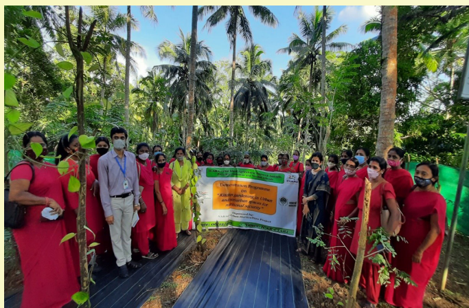
Anganwadi workers attending the awareness programme