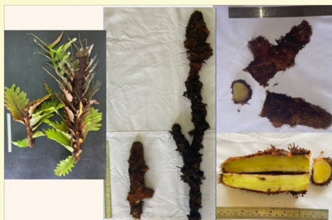
Rhizomes of Drynaria quercifolia

The collections of D. quercifolia rhizomes from nine different host plant (habitat) showed significant difference in the morphological characters, the longest rhizome (127.267 cm), fresh weight of rhizome (2290.00 g) and dry weight of rhizome (917.24 g) was recorded in the collection from coconut followed by Crypteronia paniculata host (129.00 cm, 1906.00 g and 743.81 g respectively) while the lowest value (89.67 cm, 289.70 g and 94.01 g respectively) was recorded from Rhizophora mucronata host plant. The rhizome was subjected to biochemical analysis by following the standard protocols. The biochemical variability among the collected rhizome and skin showed the significant difference, the highest phenolic content (91.13 mg/100g and 92.87 mg/100g respectively), flavonoids (96.70 mg/100g and 78.43 mg/100g respectively) in rhizome and skin was obtained in the rhizomes collected from Crypteronia paniculata host plant. The highest tannin (192.00 mg/100g; 219 mg/100g respectively), saponin (192.50 mg/100g; 183.27 mg/100g respectively) and reducing sugar (384 mg/100g; 379.67 mg/100g respectively) were observed in the fern collected from Mangifera indica host plant. The highest carbohydrate (2045.33 mg/100g; 1910.87 mg/100g respectively) and protein