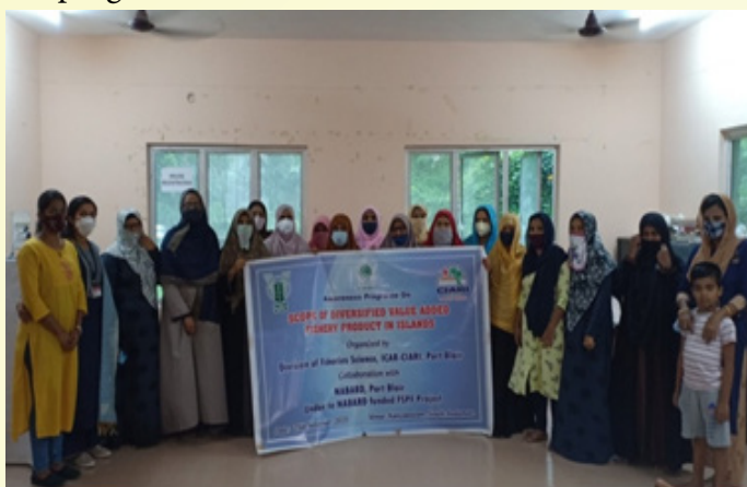
Trainees of value added fish products

ICAR-Central Island Agricultural Research Institute, Port Blair conducted an awareness programme on “Scope of Diversified Value-added Fishery Products in Islands” on 25th November, 2021 at Kanyapuram Village, South Andaman. A total of 26 women stakeholders have participated and benefitted from the programme.