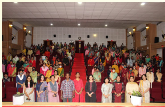
Training cum demonstration on “Roof top production model”

A training cum demonstration on “Roof top production model for self-sufficiency” delivered