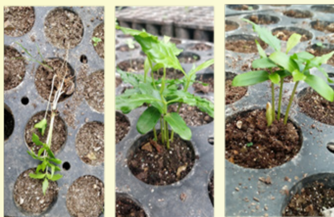
Occurrence of polyembryony in Rudraksha

During the seed regeneration of five carpelled Rudraksha ( Elaeocarpus ganitrus ) for conservation of native ornamentals, a phenomenon called polyembryony was observed in few seeds during seedling emergence. This occurrence of polyembryony is the first report in the species Elaeocarpus ganitrus . The number of seedlings germinated per seed ranged from 1 to 5. The polyembryonic seedlings from each seed was found to be equally vigorous.