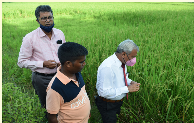
Awareness on management of rice cultivation

A training-cum-awareness on “Management practices in rice seed production” was organized at Madhupur village of Diglipur on 19th October 2021 for the benefit of rice farmers under AICRP seed (Crop) in collaboration with ICAR-CIARIKVK, Nimbudera. A total of 55 (35 male and 20 female) farmers got benefited from the programme.