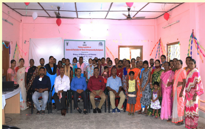
Training on value addition of cut flowers

ICAR-CIARI in collaboration with NABARD, Port Blair organized three days training on “Cultivation and value addition of cut flowers for entrepreneurship development in A & N Islands” at Namunagar Panchayat hall for the SHG beneficiaries of Surabi NGO during 9 -11 November, 2021. A total of 35 participants were attended the training.